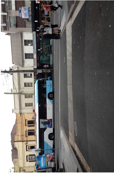
example of continuous footpath treatment